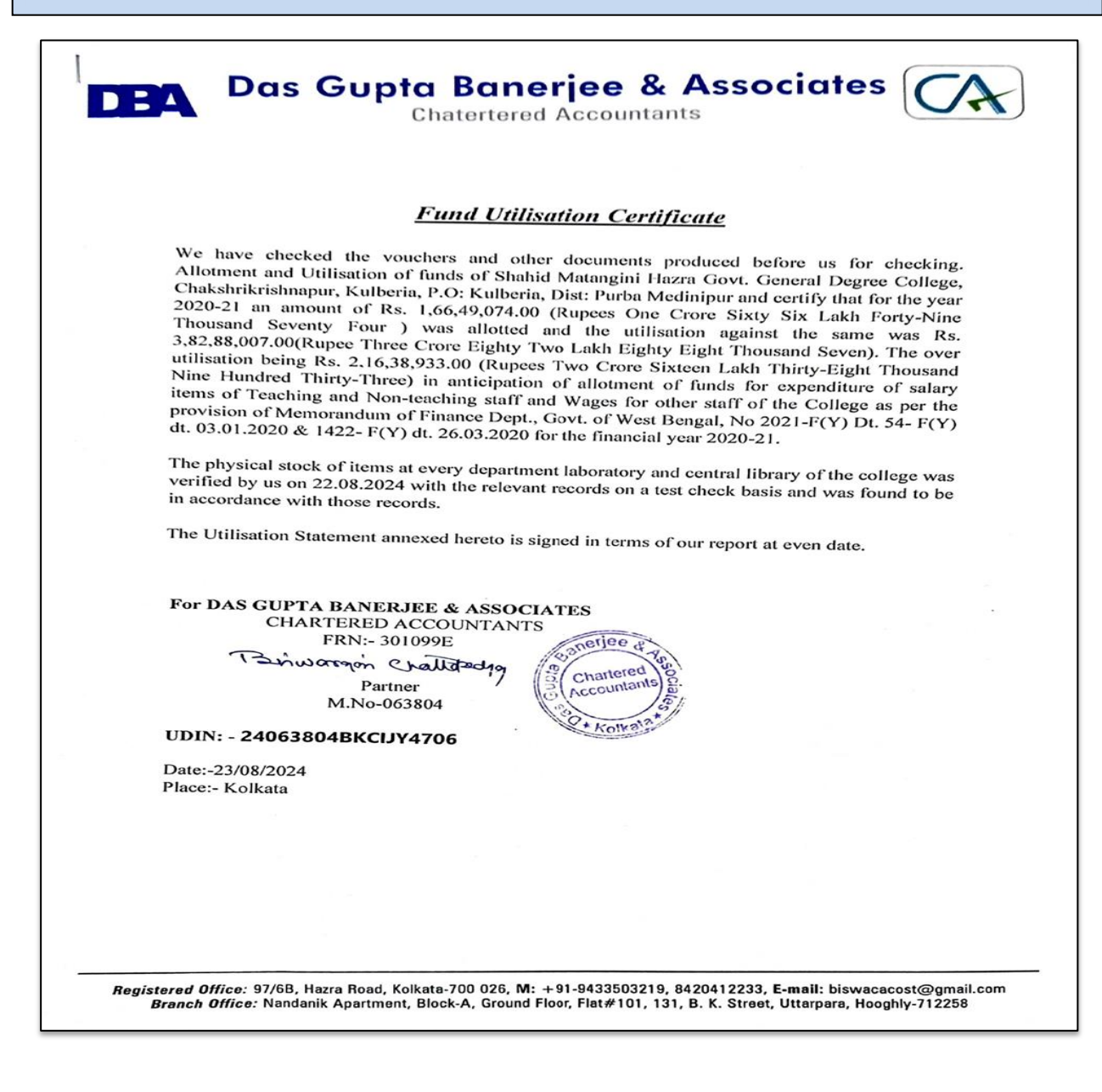
Principal Shahid Matangini Hazra Government General Degree College for Women Chatsrithrshnapur, Kufberia, Mimtouri Tamilut, Purba Medinipur

Highlighted audited income and expenditure statement of the institution for physical facilities and academic support facilities excluding salary component 2020-21